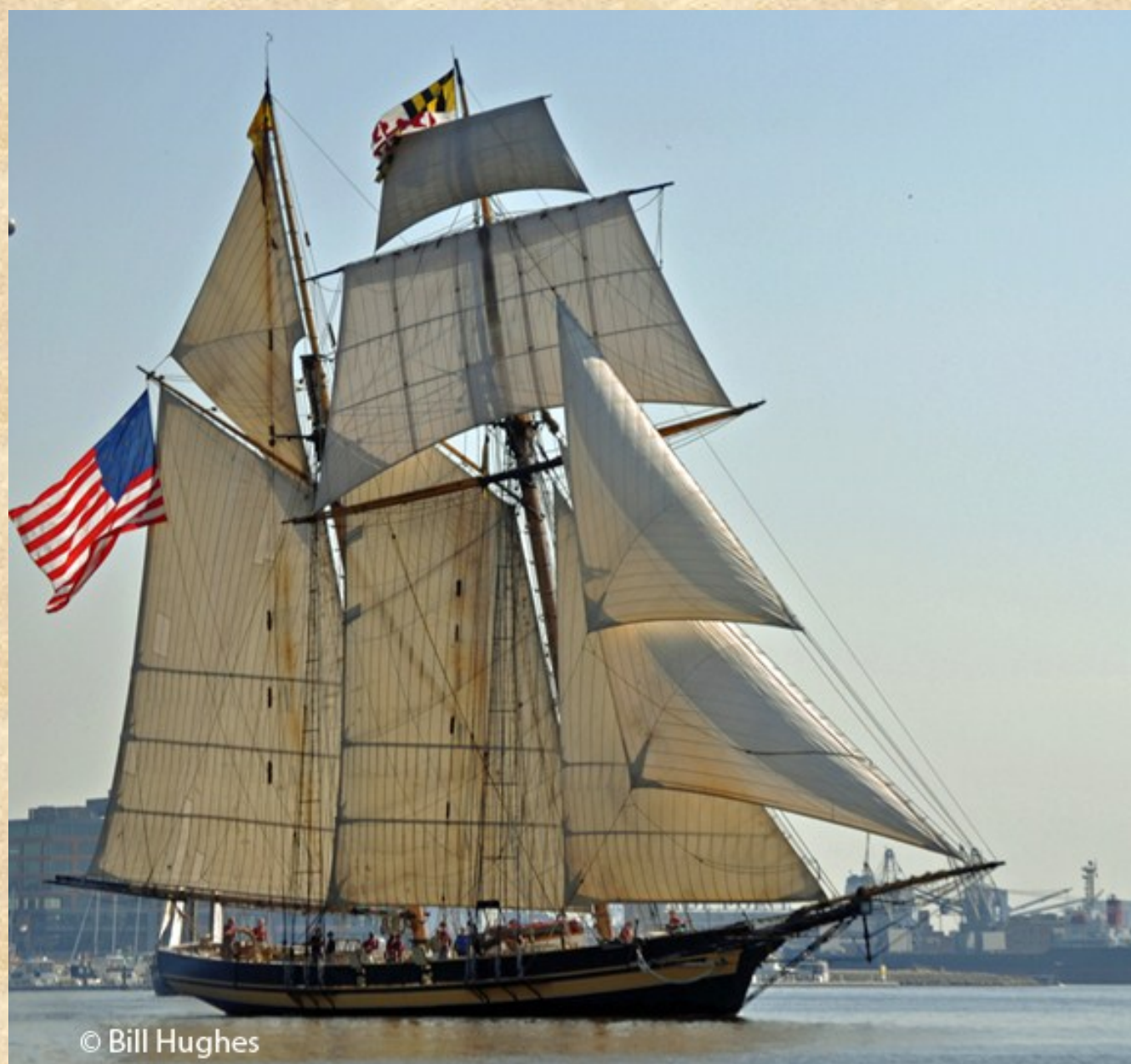
Pride of Baltimore II

Continue through the display to learn the history behind the ships, the daring men who sailed them and the role privateering played in defending freedom of the seas.