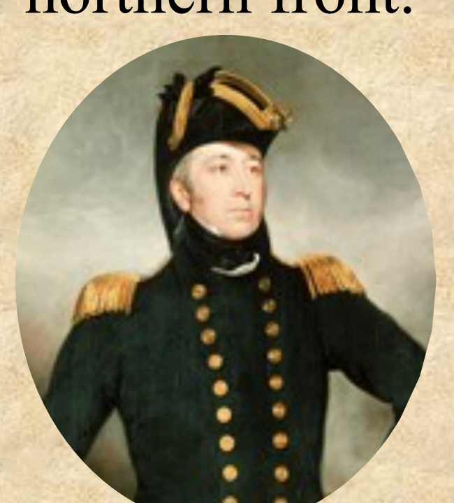
Rear Admiral George Cockburn

"Thirteen barges are coming up full of men. We are all under arms here, and expect another attack hourly"