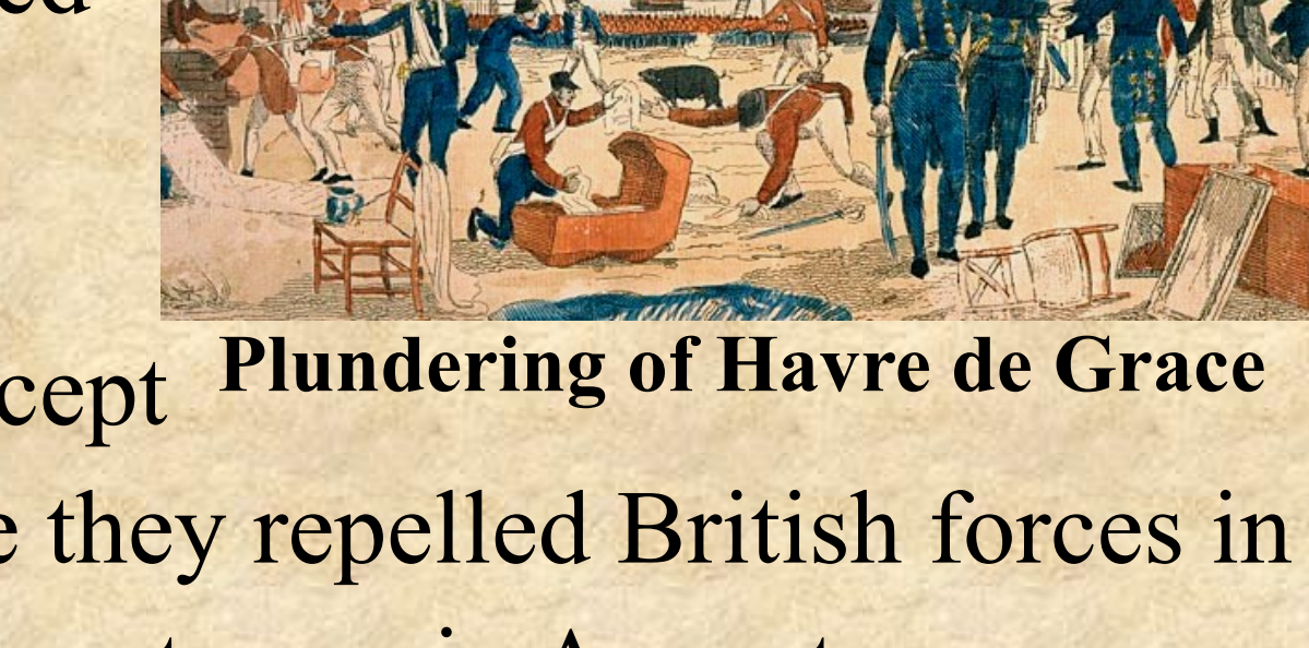
"I have it in mind to give them a complete drubbing before the peace is signed." - Cochrane to Lord Melville

ineffective against the British, except at Elkton and St. Michael's where they repelled British forces in the second raiding attempts on those towns in August.