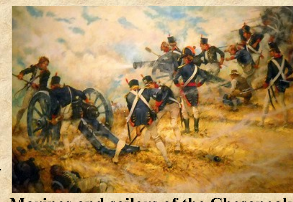
Marines and sailors of the Chesapeake Flotilla man the batteries at Bladensburg.

intent on capturing Washington marched unopposed through Southern Maryland. On August 24th, at Bladensburg - just five miles east of the city, 6,700 ill-prepared militia and regulars faced 5,400 British troops led by Major General Robert Ross. In just a few hours, the U.S.